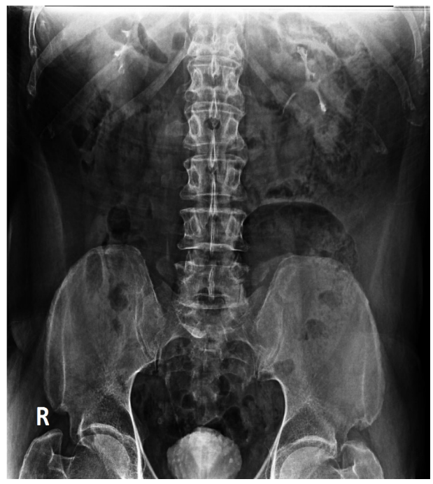
Figure 2. Excretory urography after 3 months.