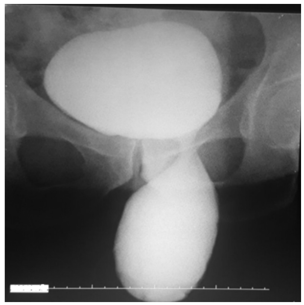
Figure 2: A 52 year-old man with left scrotal bladder hernia who had previous left inguinal hernia operation